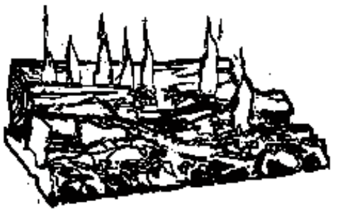
Illustration 21.1 When the burner is clean and the Fireplace is operating properly, the flame pattern will look approximately like the drawing above.

If the ceramic front glass becomes cracked or damaged, follow the instructions below to remove the frame and damaged glass. Never operate the stove with broken glass.